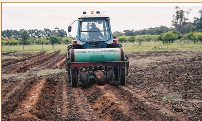
Photo 3: An early niche seeder